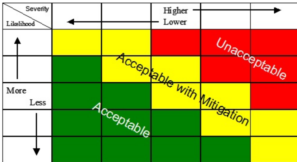
Figure A-2. Safety Risk Matrix Examples